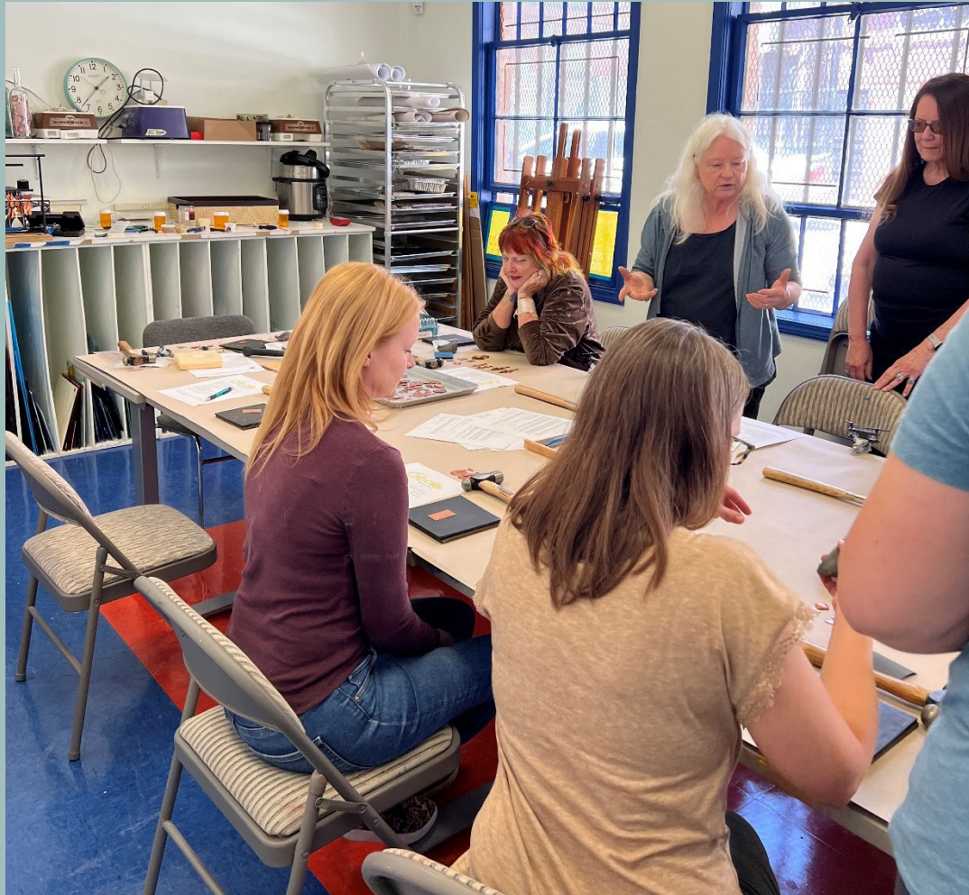
2025 Mini Grant Awardee: The Groove Artspace Workshops for Military Families – Albuquerque, NM