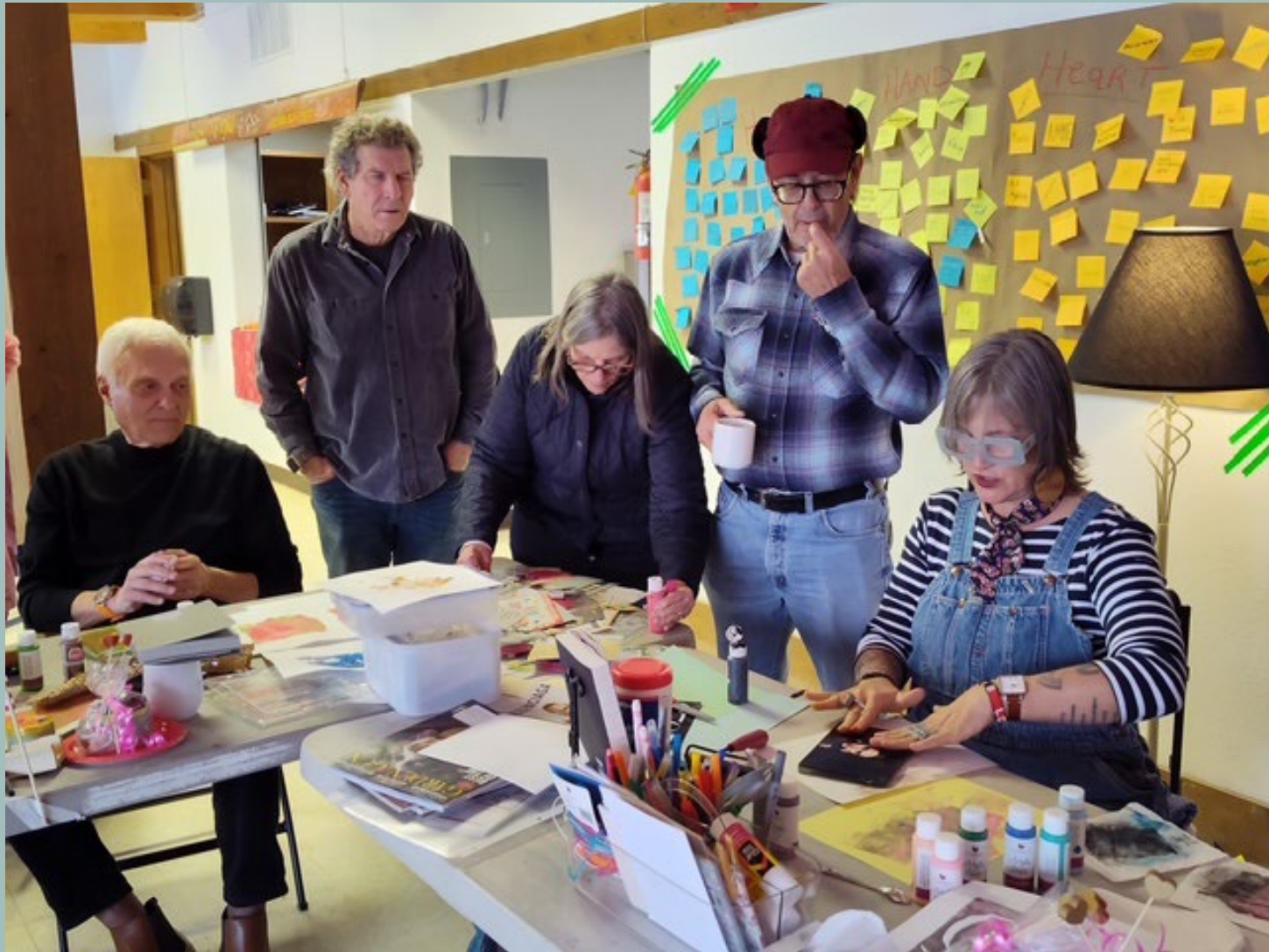
2025 Mini Grant Recipient: The National Ghost Ranch Foundation Veterans Gathering Weekend – Abiquiu, NM