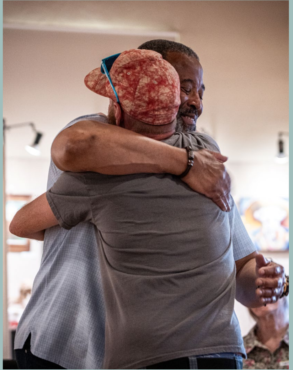
Veterans Arts Showcase Month at Otero Arts, Alamogordo