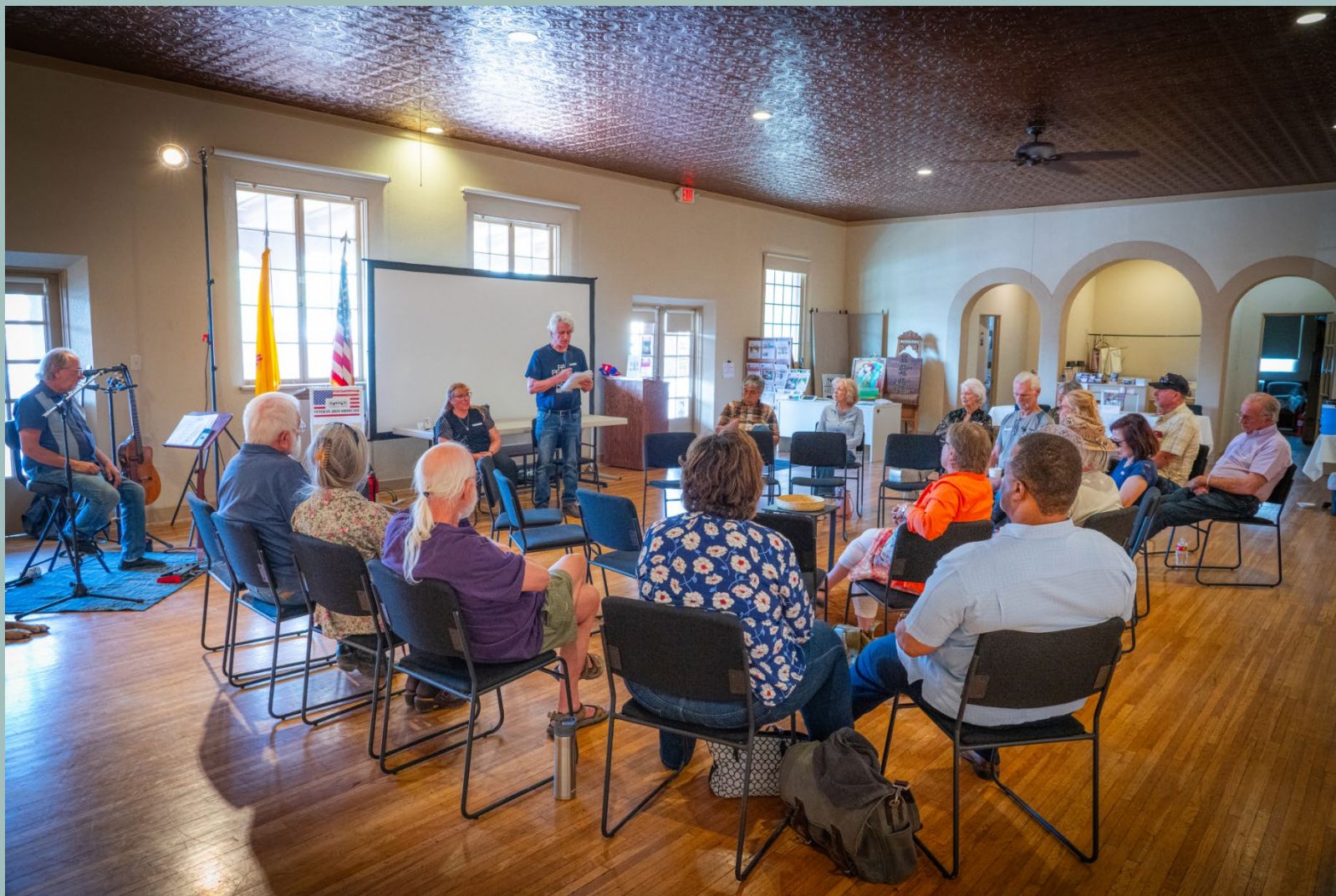
2025 Veteran-Civilian Reading/Workshop presented Otero Arts, Alamogordo