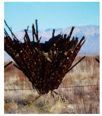
Water Harvesting Sculpture, NM