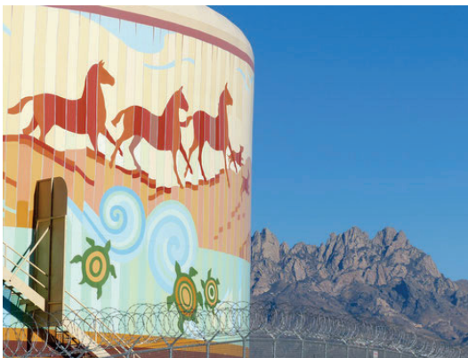
Mural on Water Tank, NM