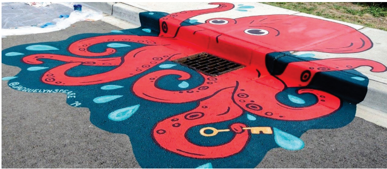
Stormwater Drain Art, WA