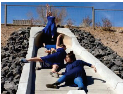
National Water Dance, NM