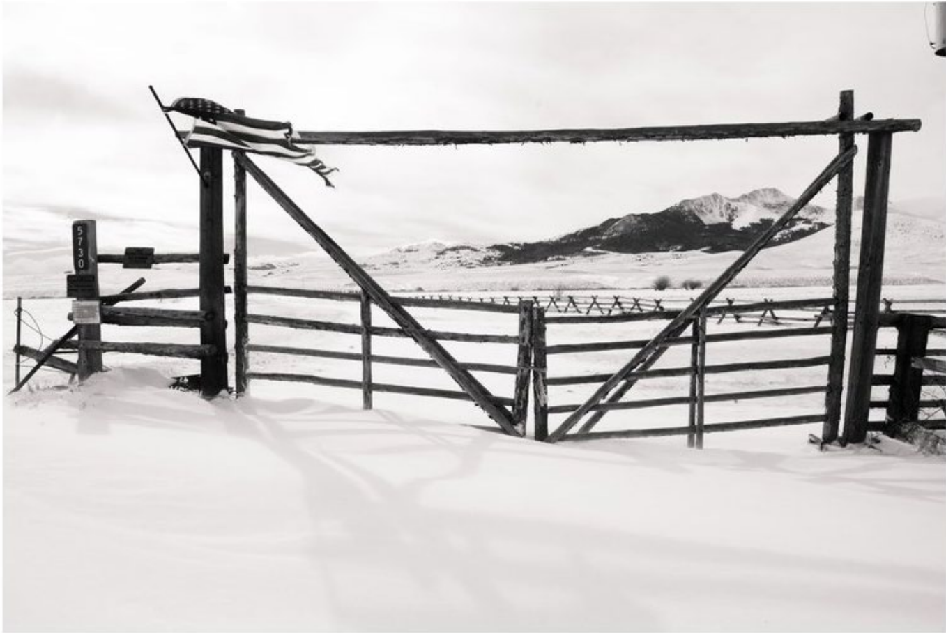
2024 Mini Grant Awardee: CENTER, Visual Storytelling Lab – Santa Fe, NM – Snowfield, Montana