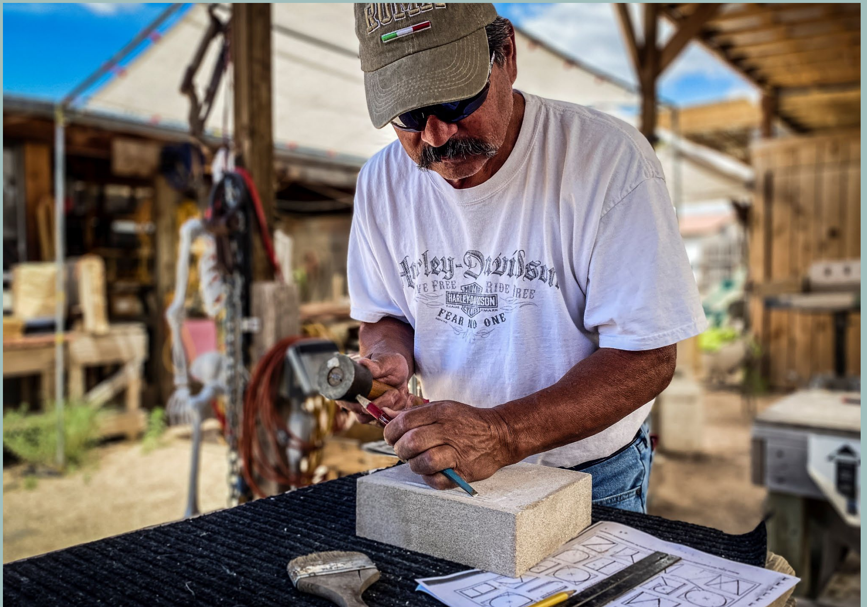
Stone Carving Class presented by Paseo Project, Taos