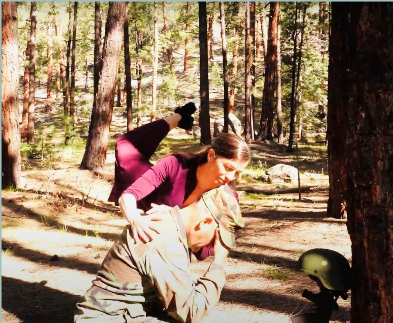
Healing After The Storm Dance/Film, Produced by Team Bravo, Albuquerque