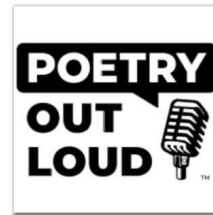
Poetry Out Loud