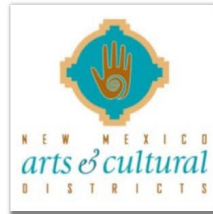
Arts & Cultural Districts