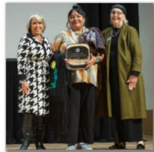
Governor's Arts Awards