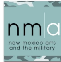
Arts & the Military